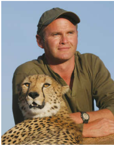
Guest of Honour and recipient of the BNA Peter Scott Memorial Award Simon King

Saturday, 10 May 2008 Forest School, Snaresbrook Epping Forest